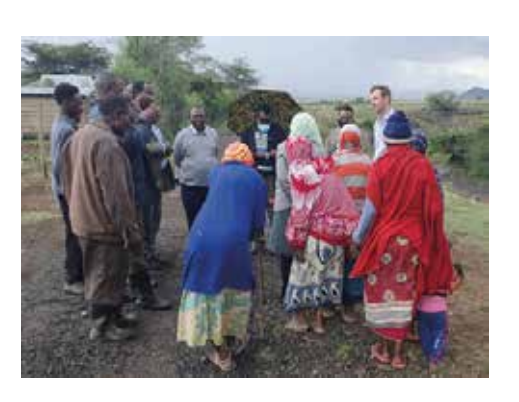
Visit to Oldonya Sambu village facing health impacts of elevated fluoride in groundwater