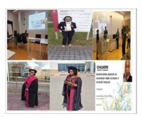
PhD Graduates from UDSM-Sida Programme