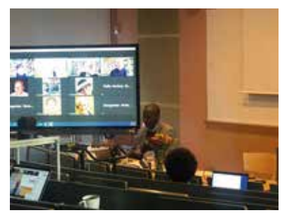
Viva voce during COVID-19 error