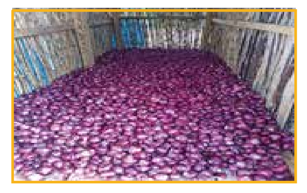
Food Security Sub-programme

DAFWAT sub-programme investigates and optimizes the use of low-cost affordable adsorbents to remove fluoride and arsenic from drinking water sources. The programme emphasises on generating local knowledge through specialised training of staff and students on developing low-cost water treatment options. A pilot water defluoridation plant using available natural material (combination of calcined gypsum, bauxite, and magnesite) was installed and tested at one of the places with excess fluoride.