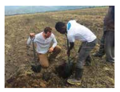
Field Work at Kilombero