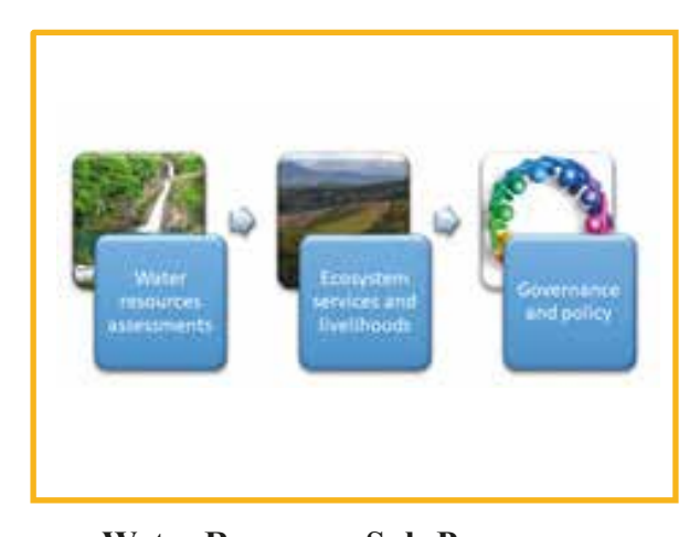
Water Resources Sub-Programme

SUSTAIN (Sustainable Sanitation in Theory and Action) is a capacity building program strives to generate actionable knowledge which in Tanzania. It takes into account both the environmental aspects and boundaries inherent in the water and waste cycle to come up with sustainable solutions to the sanitation problems faced.